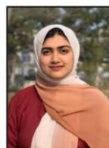
Farisa fida Kerala