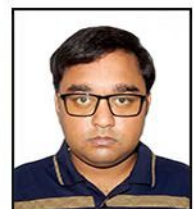
Minhajul Islam West Bengal